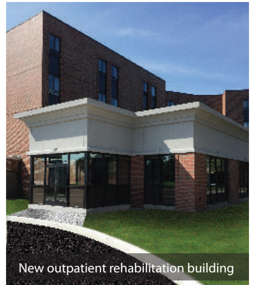
New outpatient rehabilitation building

All of these factors will enhance our reputation as THE place to be for senior care and senior living in Western New York. With these additions, it will also create new opportunities for growth for our employees. As the 88th largest employer in Western New York, and the second largest in Clarence, we want to continue to also make this THE place to work!