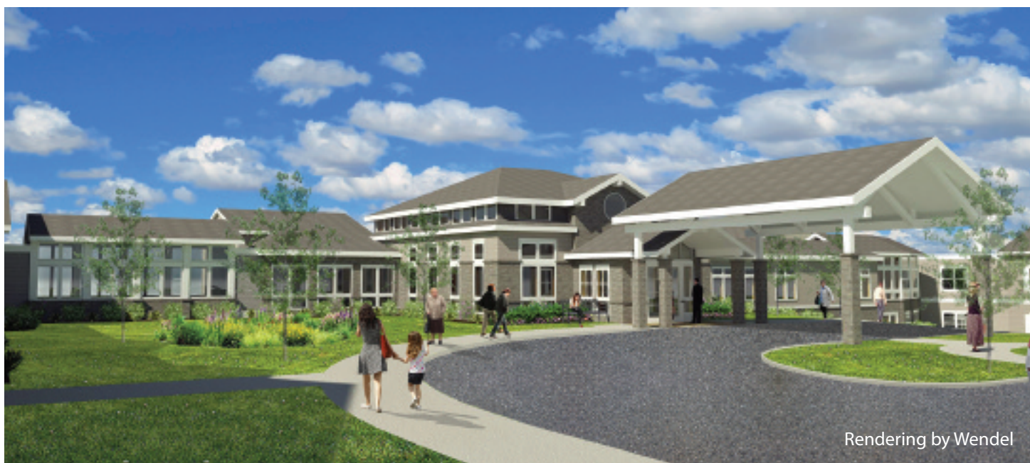
Rendering by Wendel

The Brothers of Mercy is moving forward with a new assisted living facility and a memory care building. With ninety six total beds at a cost of $17.5 million, construction is scheduled for the first half of 2019.