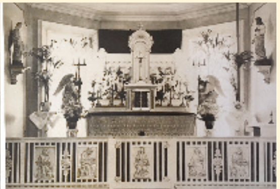
The Community Chapel inside the Cottage Street residence in downtown Buffalo. The Brothers began caring for and providing residence to patients here in 1925.